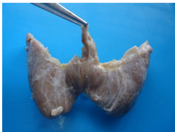
Figure 5: Thyroid gland of a 94 year old male with median pyramidal lobe (weight 22g).