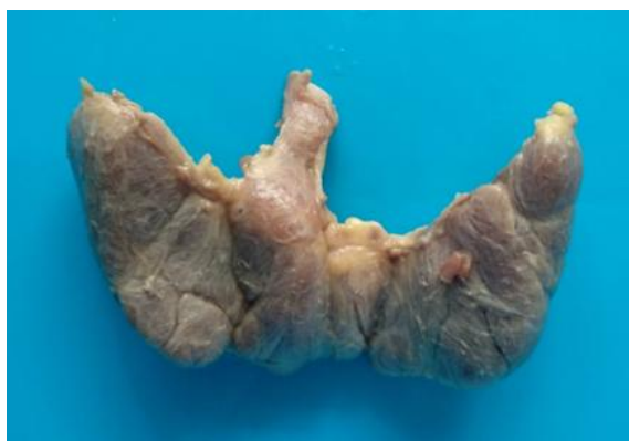
Figure 3: Thyroid gland of a 40 year old male with right pyramidal lobe (weight 26g).