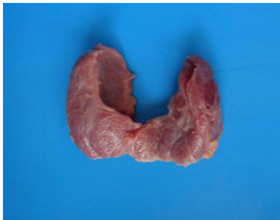
Figure 1: A normal thyroid gland specimen of a 43 year old male showing right and left lobes & isthmus

from left lobe of thyroid gland, 18% had left pyramidal lobe [Figure 4], 11% specimens had right pyramidal lobe [Figure 3]. 7% thyroid glands had median pyramidal lobe [Figure 5], which was extending upwards from isthmus of thyroid gland in the median plane. 97% of specimens were having isthmus where as 3% were having no isthmus.